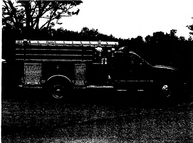
New Rescue Truck

The Fire Department responded to an average number of calls during the past year. We are fortunate to have three EMT's on our department. All will be certified by the May 2005 town meeting. The Fire and Police department each sponsored one EMT to attend the many hours of training. We thank each EMT for their initiative and dedication to the town. Our department received a grant for a new truck and with help from the Town; we were able to purchase a 2004 Rescue Truck, outfitted with basic equipment. Our last new truck arrived in 1991. As always, we appreciate your generous support, be it through donations, appropriations or just helping out.