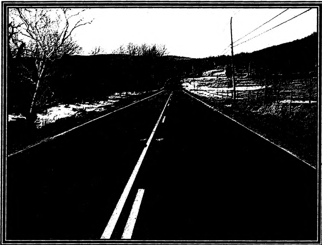
COMPLETED SKYLINE TRAIL